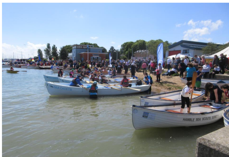
Hamble River Raid 2017